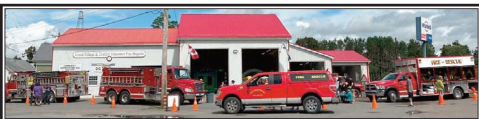
A display of rolling equipment outside GV & District Fire Brigade Hall during a Community Appreciation Day on August 19th with a free BBQ and lots of activities.