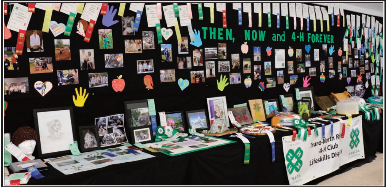
The Truro North River 4-H Club (TNR) Life Skills Display. TNR won Top Club for most points over-all.

Also see the 4-H Award story on page 10.