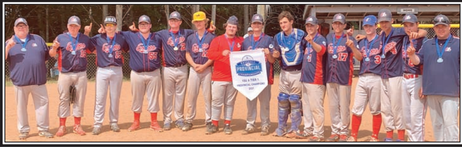
Cape Breton Expos proudly hold the championship banner after defeating host team, Great Village Tide, 6-0, in the championship game played on August 29th.

into the 6th inning. A second home run, with bases loaded brought in 4 runs for the Expos. Final score was 6-0 for the Cape Breton team, with the Great Village Tide finishing off the tournament with 3 wins/2 losses. Congratulations to all who took part. It was good to see a Provincial Championship held locally!