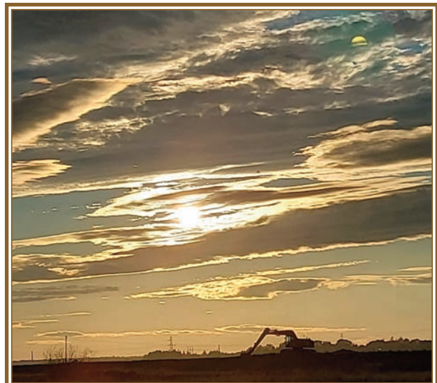
The evening is in its glory off Robie Street in Truro facing west. I just had to get the excavator in the picture. I thought it made the moment. Submitted by Liza Madore.