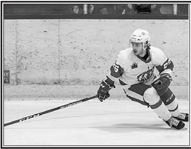
Brandon Cianflone.