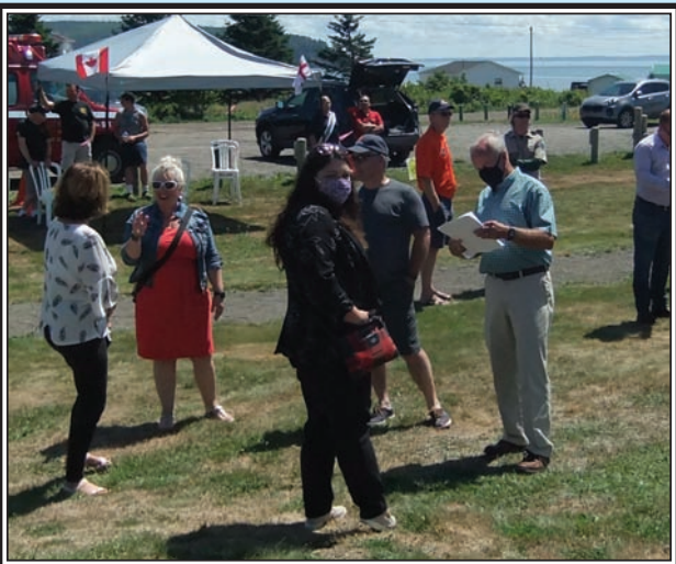
A portion of the over 200 people in attendance several attendees, all observing social distancing are shown near the entrance to the ceremonies.