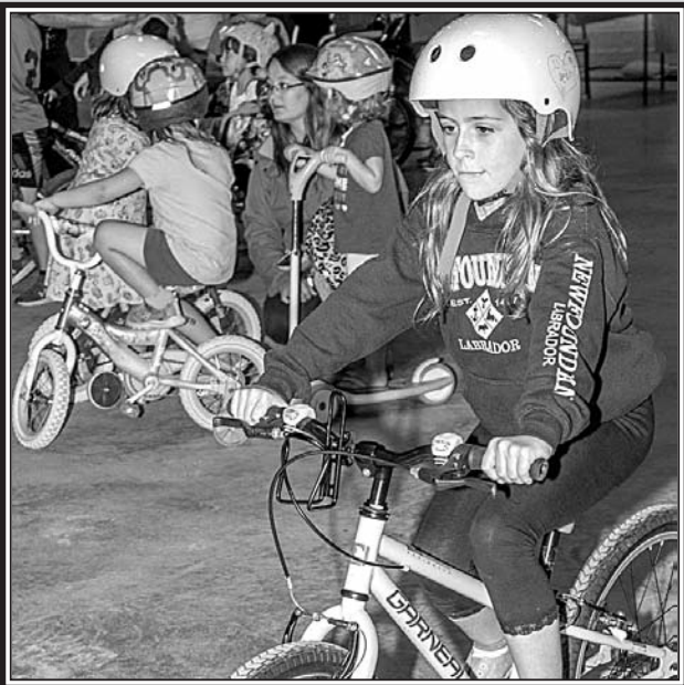
Facial expressions show the intensity of concentration as this young lady gets tested.