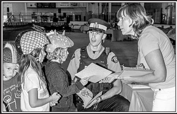
Held inside, due to inclement weather, it was time for bike rodeo participants to get a certificate and colouring book for their participation.