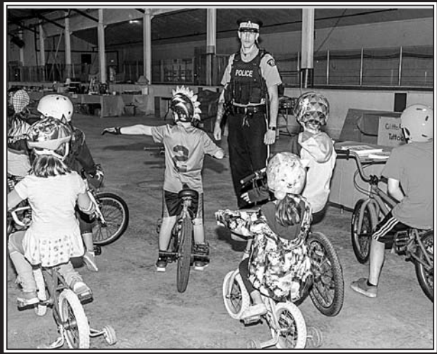
The Old Home Week Bike Rodeo was an excellent opportunity for young people to both have fun and be reminded of road safety. An RCMP officer puts students through a series of riding demonstrations.