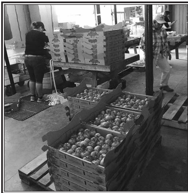
Workers applying produce stickers to individual tomatoes readying the flats for shipment to grocery stores.