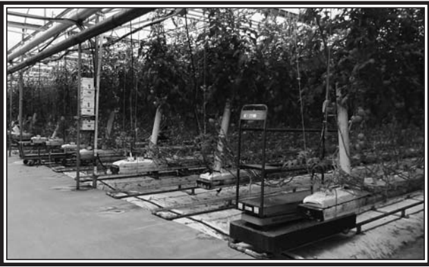
A small portion of the tomato growing section at Stokdijk's Greenhouses in Beaverbrook, Colchester County. For size of the greenhouses think in terms of acres under glass.

Council is awaiting for a date to fight the ticket in court.