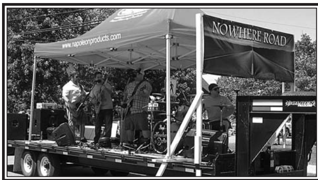
No Where Road Band