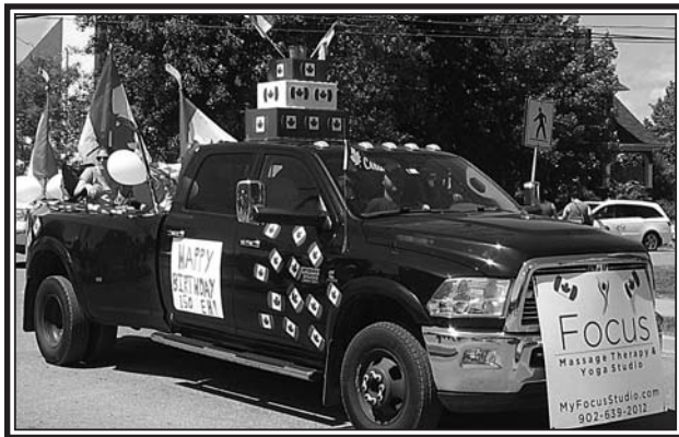
Focus Massage Therapy