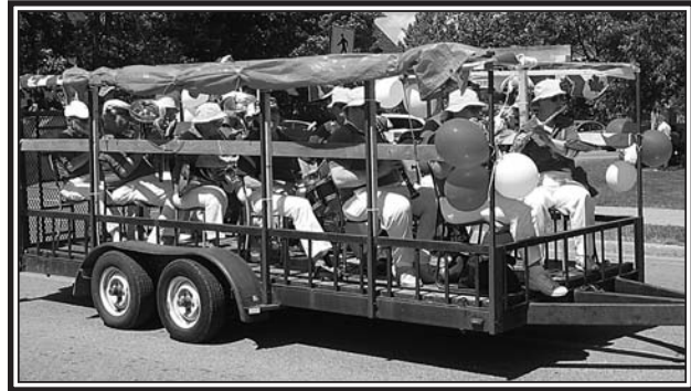
Parade - Band Float