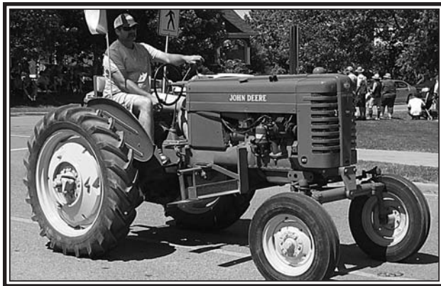
John Deere Tractor