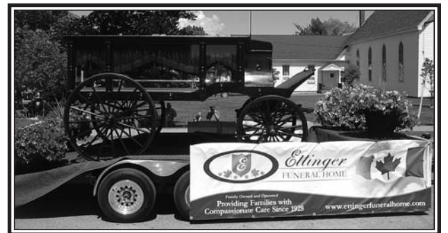
Ettinger Funeral Home