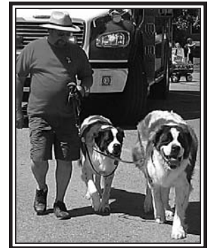
St Bernard Dogs