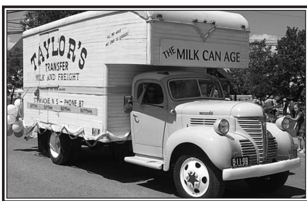
The Milk Can Age