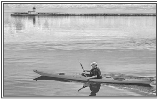
When the tide is in, when water as calm as glass a kayaker enjoys a peaceful glide across Parrsboro harbour.