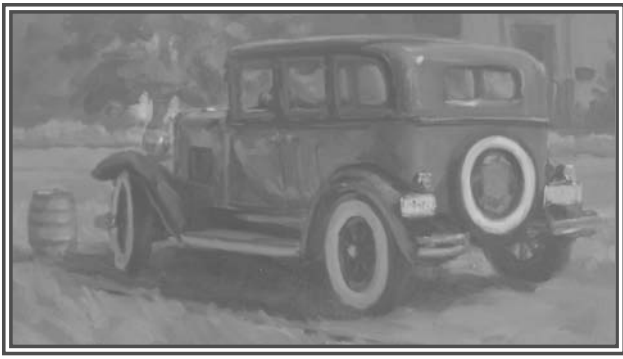
This painting of an antique car was a big hit. Back on the days, models of this type were often used as "Rum runners".