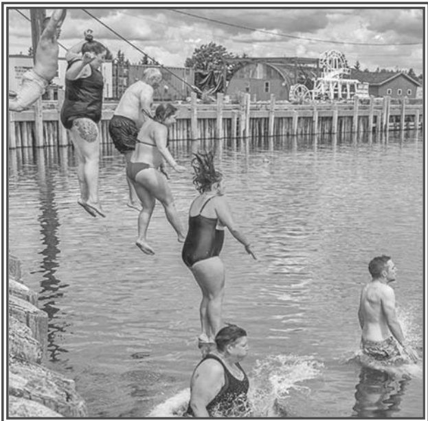
Suddenly a group appeared on the Parrsboro wharf, and then kersplash in they went!