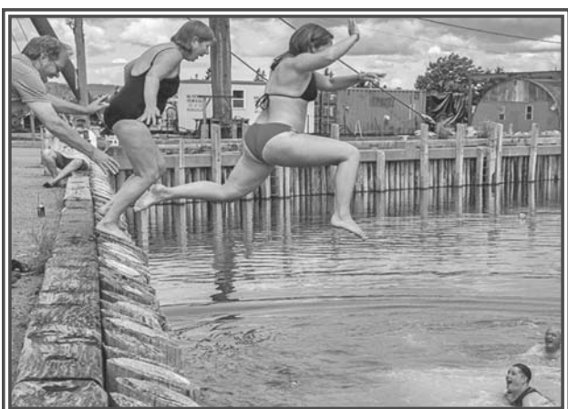
They all didn't jump at once. Looks like someone needed a bit of a push. The hot weather and strong sun does wonders.