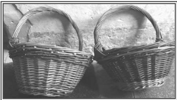
An example of baskets made at the basket weaving course sponsored by Parrsboro Creative earlier this summer