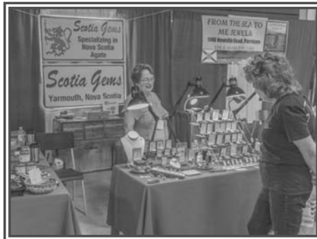
Scotia Gems, Yarmouth, NS