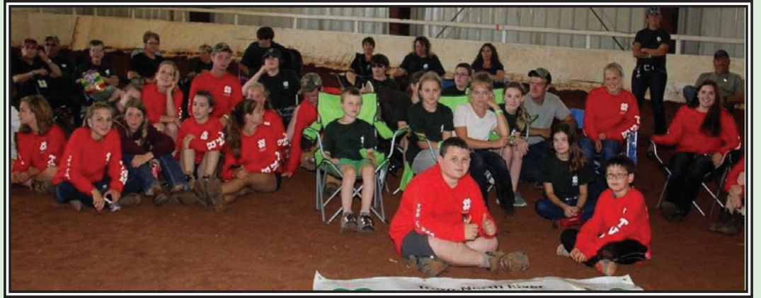
Truro- North River (TNR) 4H Club has 60 members, 8 cloverbuds, 25 leaders and is in its 28th year.