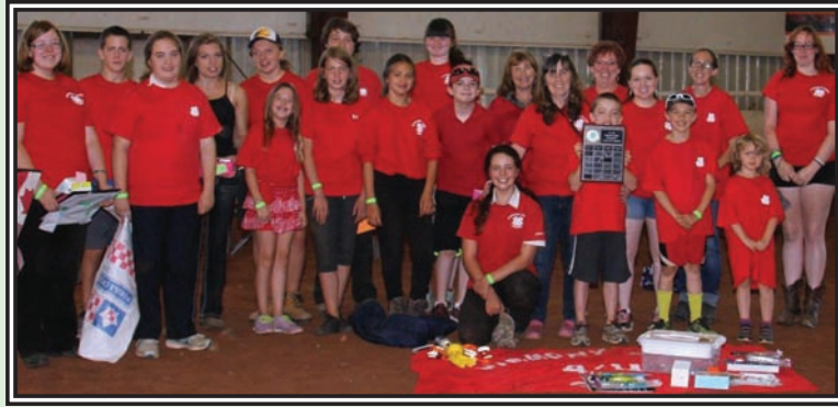
Harmony Ridge received the award for Top Club at 4H Day.