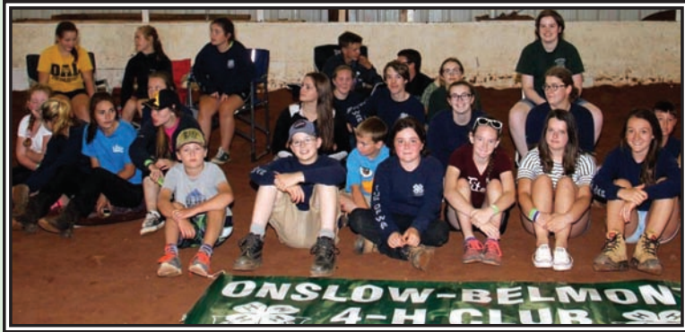
Onslow Belmont 4H Club has 43 members, 3 cloverbuds, 12 leaders and is the longest serving club in Colchester County at 88 years.