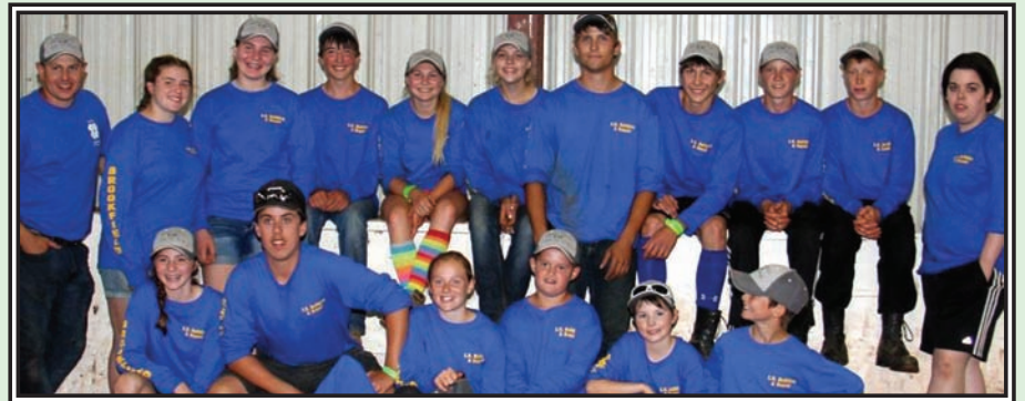
The 2016 Tug-of-War Champion Team was Brookfield 4H Club, who beat out TNR in 2 minutes 12 seconds.