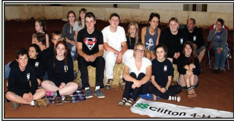
Clifton 4H Club has 41 members, 8 cloverbuds, 19 leaders and the club is in its 81st year.