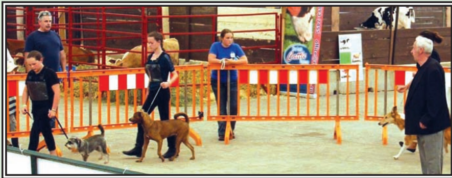
Dog Obedience and Showmanship were held in the Agridome with 5 competitors taking part.