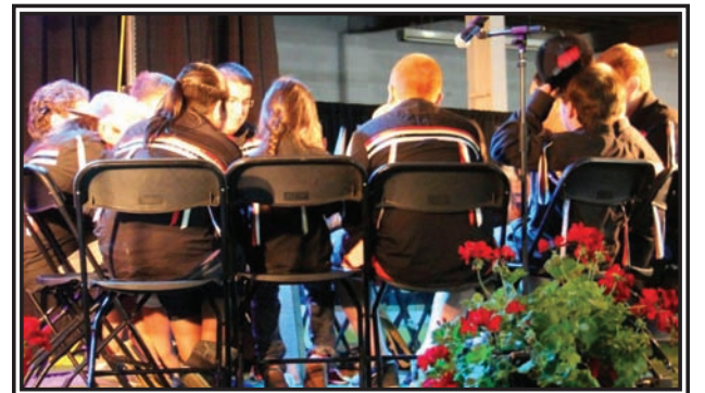
Members of the Samqwan Boyz Millbrook drumming group performed at the Opening Ceremonies for the 2016 Nova Scotia Provincial Exhibition.