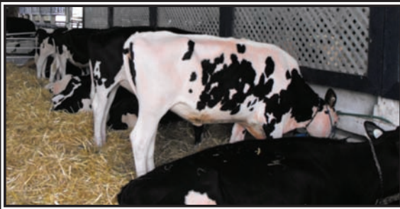
Onslow-Belmont 4-H dairy calves at the NSPE.