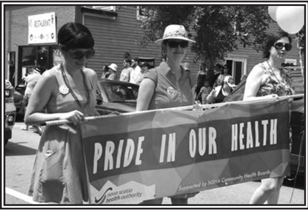
Mental Health and Addictions staff members from the Nova Scotia Health Authority participating in the inaugural Pride Parade in Truro on July 16.