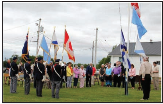
A large crowd turned out for this year's Peacekeeper's Day Service.