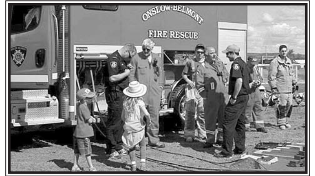
Onslow Belmont were one of several Fire Brigade's with a display set up at the NSPE racetrack on August 24th.