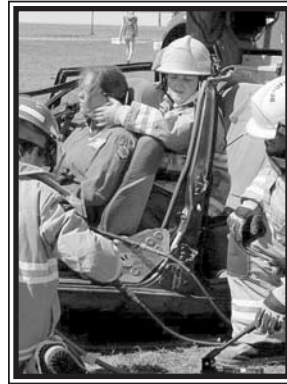
OBFB Firefighters work carefully to make sure their "patient" is secure to prevent further injury.