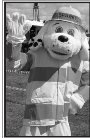
Friendly wave from Sparky!