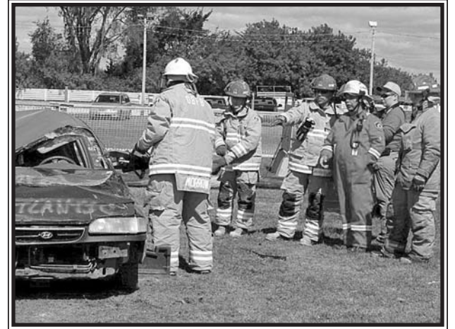
Onslow Belmont Fire Brigade completed a vehicle extrication demonstration at the NSPE in about 25 minutes. The procedure is a valuable training exercise for fire fighters.