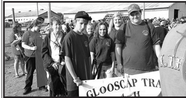
Members of the Glooscap Trail 4-H Club line up for the parade of 4-H clubs during 4-H Days at NSPE. The club came in first with 4 of its 8 members representing the club at the Pro-show in Bridgewater in early October.