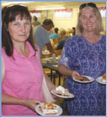
Wild Blueberry Harvest events were held throughout the month of August. There was a sell out crowd at the potluck supper at Masstown United Church on August 18th, featuring a wonderful selection of wild blueberry desserts.