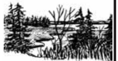
Along the Shore