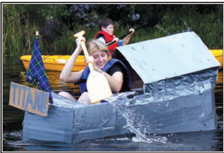
A smaller but still doomed 'Titanic' takes part in the "Board to Boat" contest. Using only cardboard and duct tape, 54 students were challenged to cross Logan Spencer's pond.

Team #14 was made up of students from Australia, Brazil