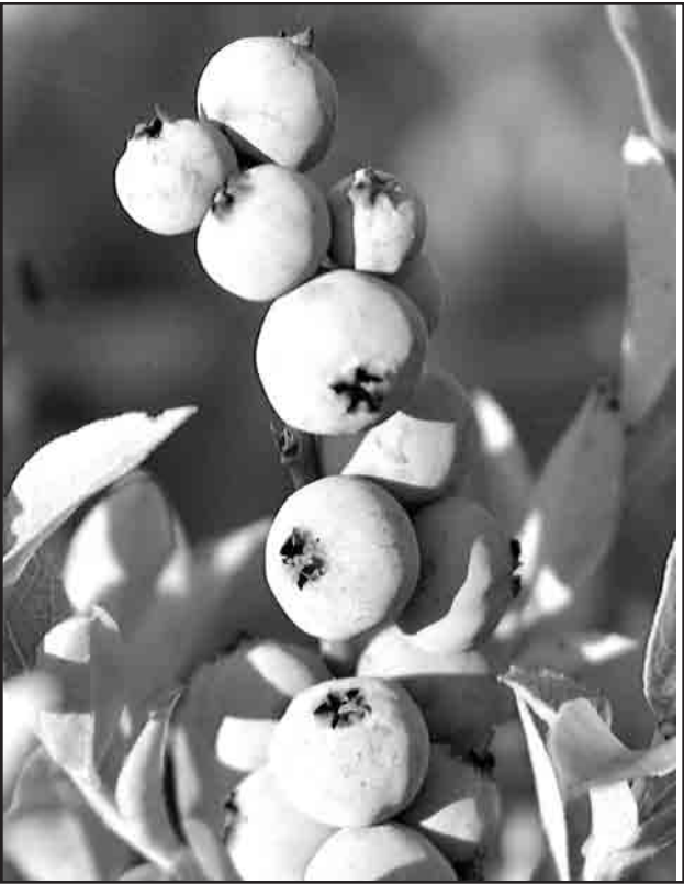
Blueberries stand ripe and ready for picking fresh from the vine.

You may think that this is a silly thing to put here in this paper, but when you think of the swine flu virus that you might have picked up from the change at the coffee shop, or from the cart in the supermarket, or almost any other public place, washing your hands correctly might be a matter of sickness or good health.