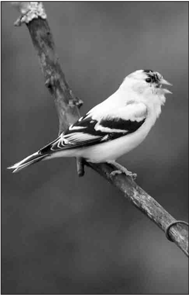
Showing off his bright new coat of the feathers, this goldfinch was merrily chirping out a song letting everyone know that spring has arrived.