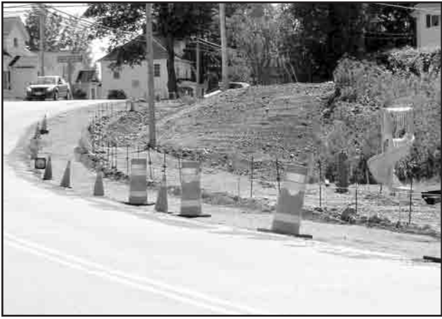
Work on a new sidewalk in front of the Debert Elementary School was being carried out in August.