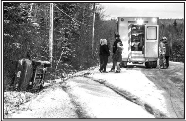
Sunday, January 29th was a strange day weather wise. The news talked about sunny day which may have happened in some areas, but in Parrsboro there was snow at that magic temperature which begins to turn VERY slippery. This accident happened at approximately 6:00pm.