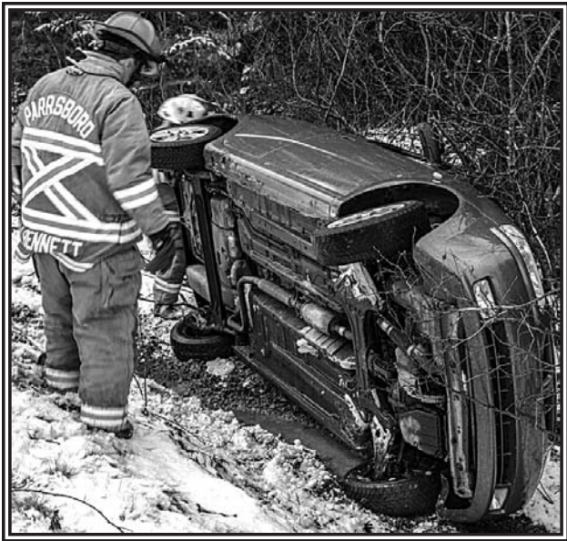
Going up Long Hill, Hwy 2 to Truro, this motorist lost control. Luckily his speed was very low as he slid down the embankment, and then the car rolled on its side. No-one hurt, Parrsboro Fire & RCMP responded.