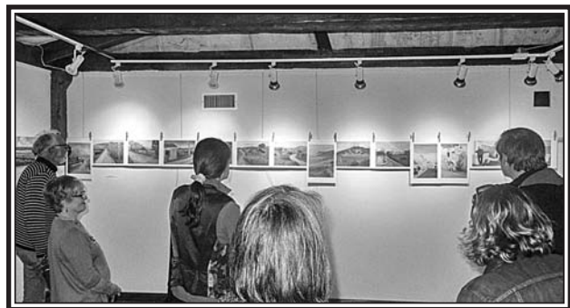
New art work and a new resident artist feature in the season opening of Art Lab Studios and Gallery.