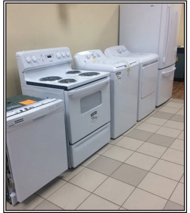
Harrison's Home Hardware have started off 2017 by deciding to place a higher focus on appliances and have enlarged the in-store display to better serve customers in the Parrsboro and South Cumberland area.

To contact the aspiring Geopark and for updates, please visit fundygeopark.ca or facebook.com/fundycliffsgeopark .