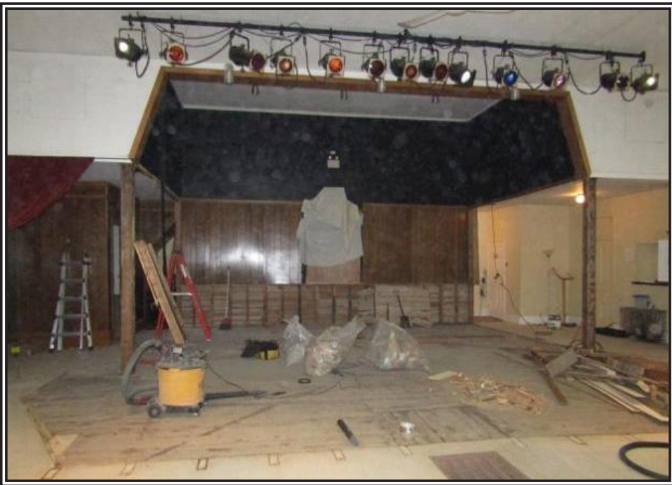
The Band Hall, Parrsboro has been without any events for the past six weeks to undergo renovations. This picture was taken on Day 1.

Progress on the renovations and activities at the Hall can be followed by visiting; https://www.facebook.com/TheHall.Parrsboro/