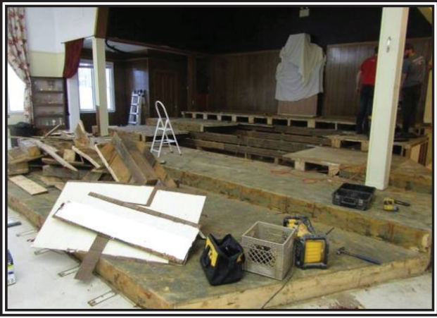
Extensive interior renovations were ongoing during January as new seating and other improvements were underway.