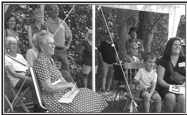
An auction was held at the Old Wentworth Valley Schoolhouse Reunion, with lucky bidders going home with tasty pies, cakes, cookies, jams and pickles.

It was a busy day, and the directors hope everyone enjoyed the afternoon and will come back next year.