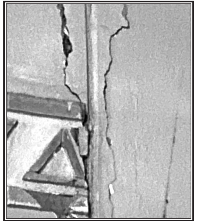
Cracks in Mayor Blair's hotel room wall appeared shortly after earthquake. (Submitted)