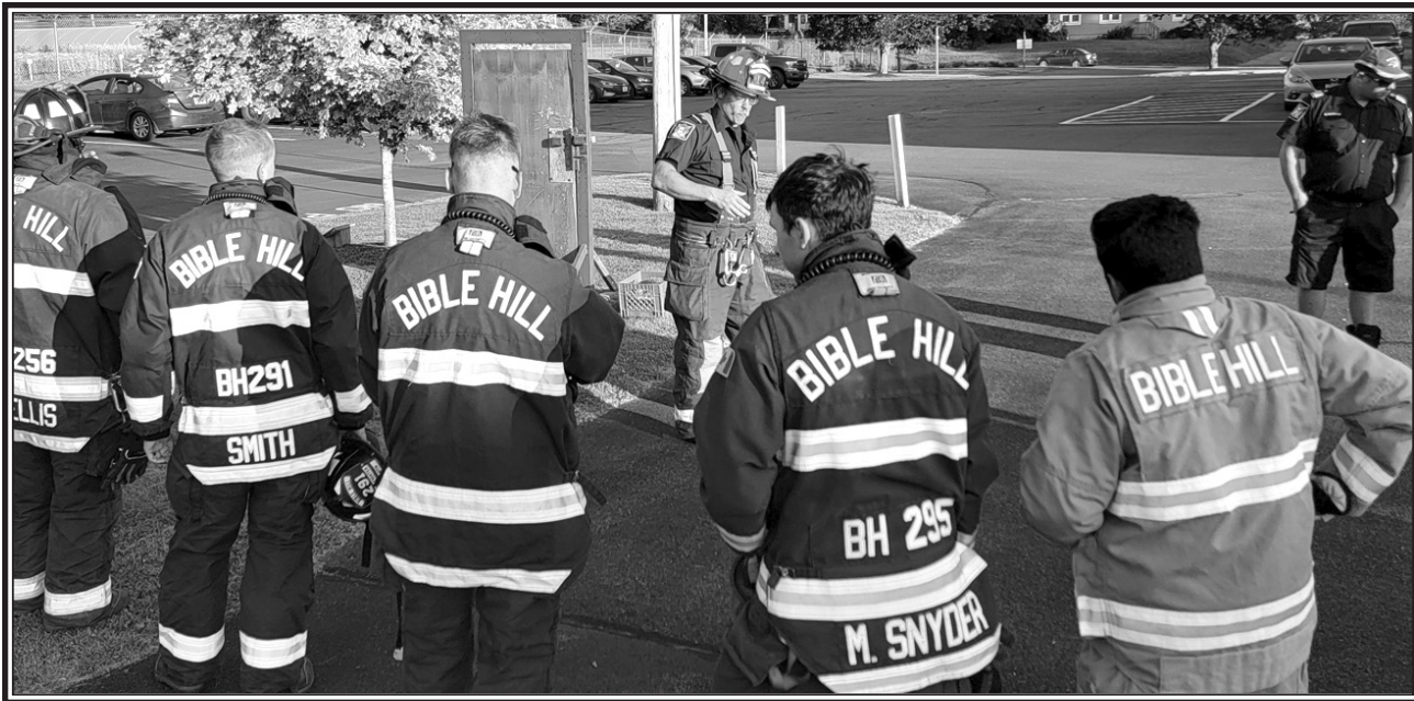
Bible Hill Volunteer Firefighters preparing for a training session during which the brigade is working on how to breach a door to enter a fire zone.