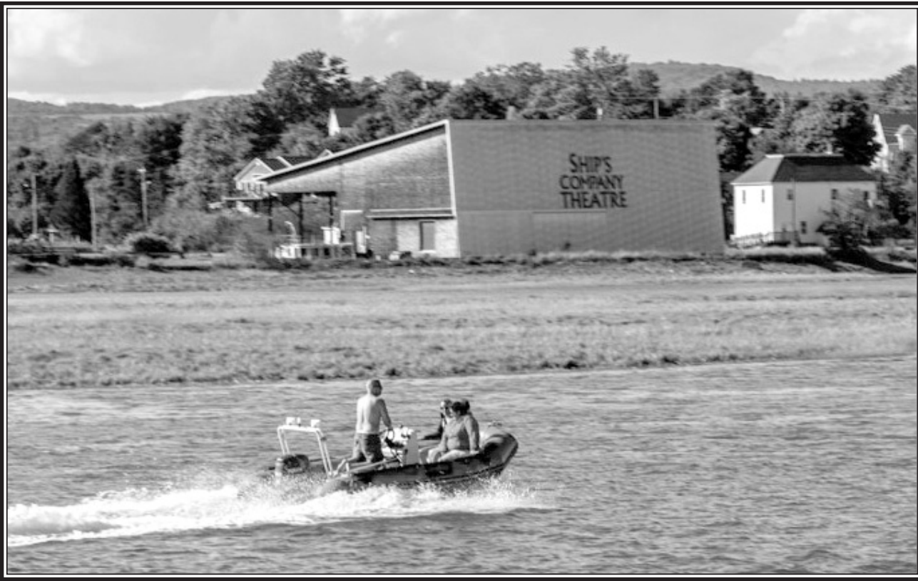
As the summer rapidly draws to a much cooler time, a few souls take time out for what is likely one their final boat rides of the year in Parrsboro Harbour.