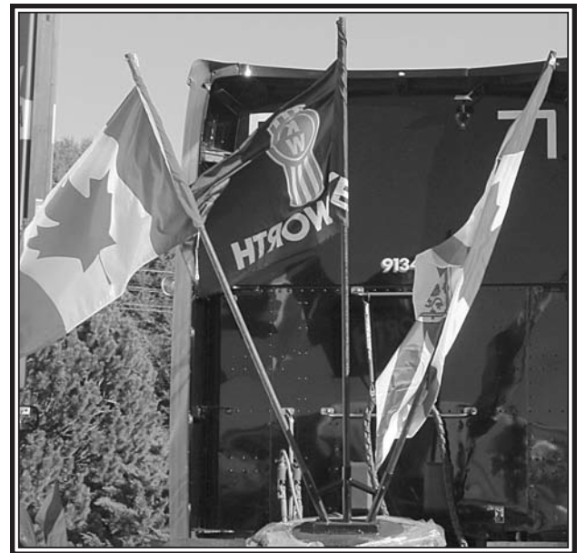
The kindness drivers felt at "Angel's Diner" earlier this year will not be forgotten.