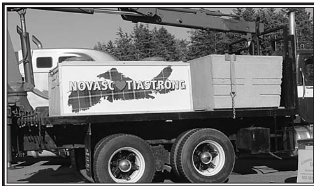
Trucks taking part in the convoy had flags and banners, including this lovely "Nova Scotia Strong" banner.