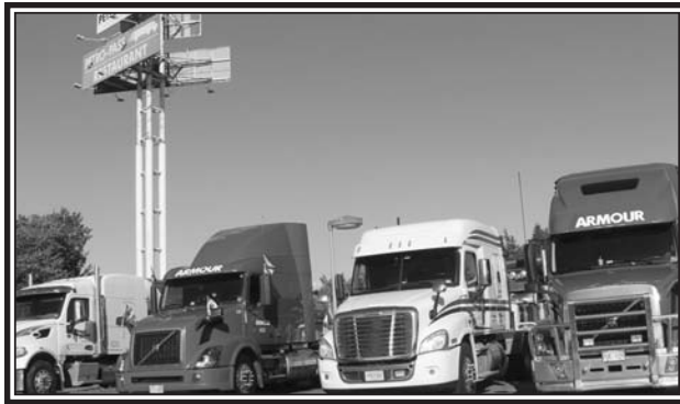
Trucks filled the parking lot of Glenholme Petro Pass.