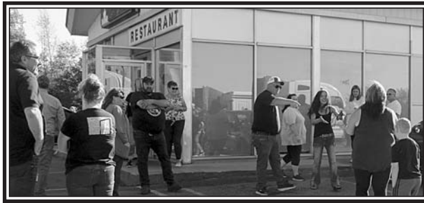
Many of truck drivers brought their families to Glenholme Petro Canada to enjoy a chicken BBQ before they headed back out on the drive to Portauisque and Bass River.