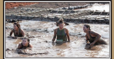
When the first wave went through this obstacle was a nice way to clean up but by the third wave the water looked more like the waters of the Tidal Bore.