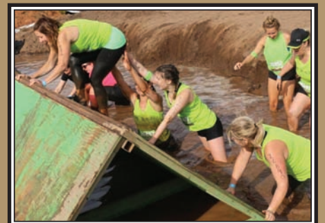
The "What the Muck!" team working together so everyone makes it over the Inverted Walls.