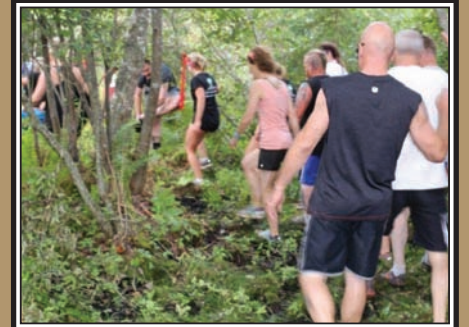
Part of the black muck challenge on the first few km's of the course.