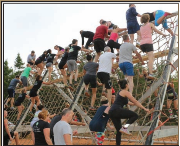
The first obstacle on the course. They made it look easy.