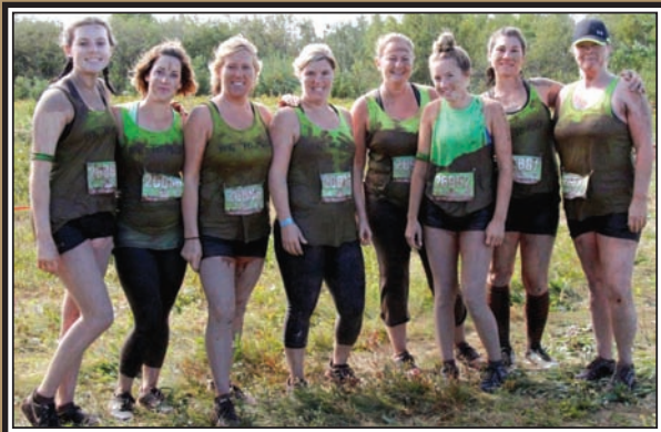
This is where the group of ladies reminded me I had told them the course was not mucky at all.