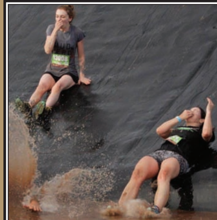
When you are guaranteed to be going under muddy water at the bottom of this massive slide, it is best to plug your nose.