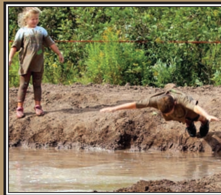
There are those who climb slowly through the mud obstacle and those who just belly flop in!