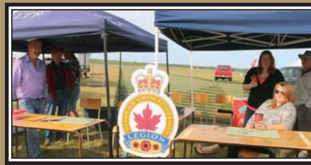
The Debert Legion was running a beverage station at the Mud Bash, the live music event at the end of the race.