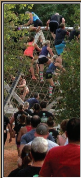
Hundreds of runners in each wave head off on a 6km trail with 18 obstacle challenges along the way.