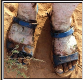
What your feet look like after a few kilometers on the Mud Hero trail when you don't wear shoes!