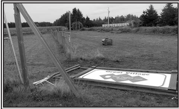
Vandals who tore up the Great Village Ballfield didn't stop at creating large ruts in the outfield, it is suspected they gained entry to the field by tearing down the sign and damaging the metal fence. Colchester detachment of the RCMP are actively working on the file.