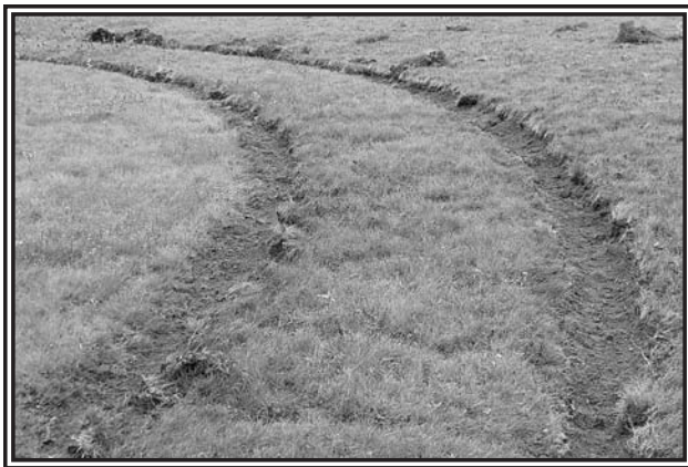
Late Thursday night or early Friday morning, September 22nd vandals damaged the Great Village Ballfield by creating large deep ruts in the outfield. RCMP have taken moulds of the tracks and are investigating. A suspect vehicle is under observation. (Submitted)