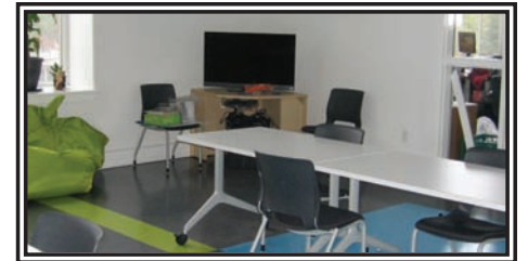
If you have work to do, or need to go online, the new Colchester-East Hants provides plenty of secluded areas, with tables and online connections.

Sponsorship has yet to be found for a Teen room; Historical Collection area; and two large spaces with lots of seating for adults. The adjoining areas are referred to as the Fireside Lounge and Community Lounge.