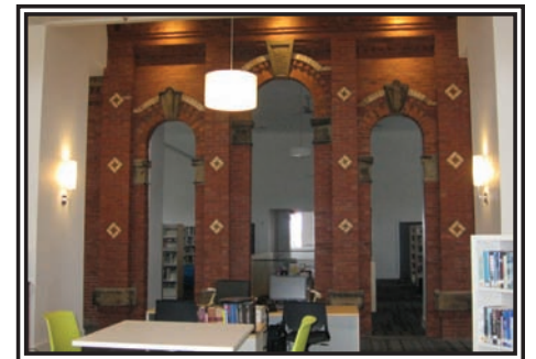
The exterior back wall of the former Normal College was saved and now forms part of the interior wall on the new edition. Shown above is the entrance way which was created by removing two of the middle windows to create entrance way between the new and the old.