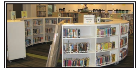
Shown here is a portion of the space and books dedicated to the Children's Fiction section houses in the newly construction section of the Colchester-East Hants Public Library.