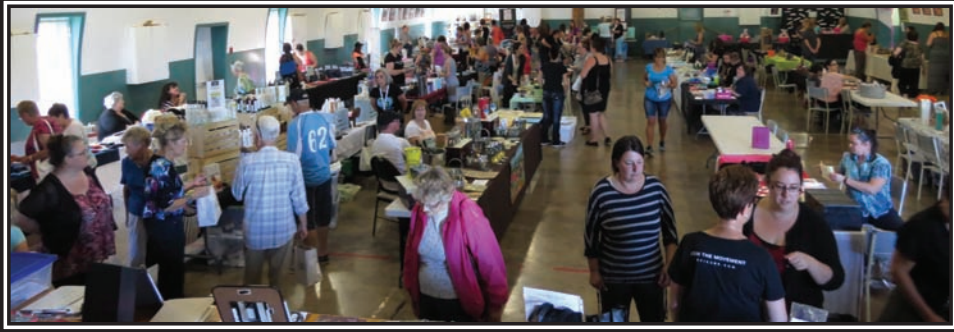
The Ladies Day Extravaganza at Economy Rec Centre on September 10 was an outstanding success as a fundraiser for the Cobequid Interpretative Centre. (Submitted)