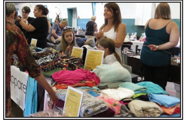
If it was wearable or could be made into great apparel, you would have found it at the Extravaganza held in Economy on September 10th.

A combination of admission, vendor fees, ticket sales and 50/50 draw resulted in over $2,200 being raised for the Cobequid Interpretative Centre. Originally, the event was to feature a food truck from Halifax, but it cancelled at the last minute the evening before. No one has confirmed it, but with the success of the first event, it is anticipated next September will see the second annual version.