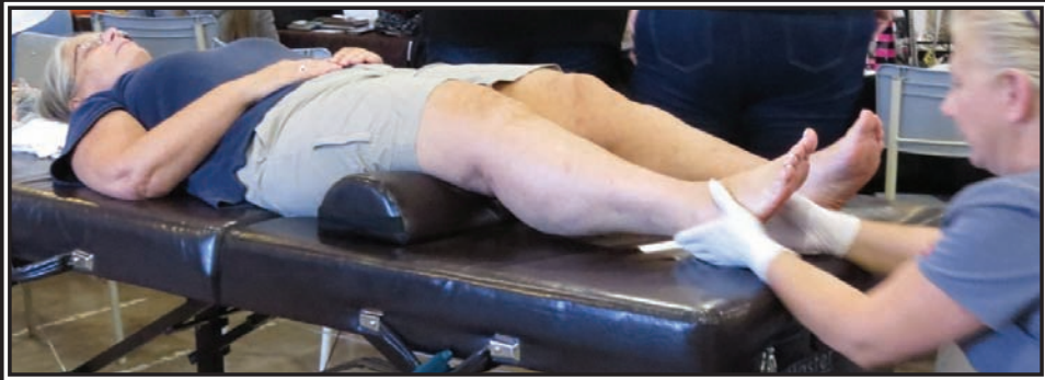
Sore Feet? Just lay on the massage table in the centre of the Economy Rec Centre, while other ladies are browsing and shopping at the array of 40 plus vendors at the first annual Ladies Day Extravaganza. (Submitted)