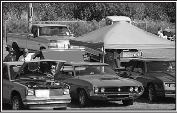
There was a grand turnout for the 1st Annual Belmont Show & Shine held at the Dr. P.R. Little Ballfield in Belmont on Sept. 19th. All proceeds went to the Belmont Community Association.