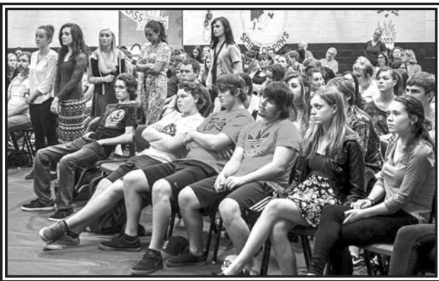
Students are lined up to ask questions of the five candidates vying to be the MP for Cumberland-Colchester.

For more information, call 1-866-226-7577 or see novascotia.ca/natr/woodlot/woya.