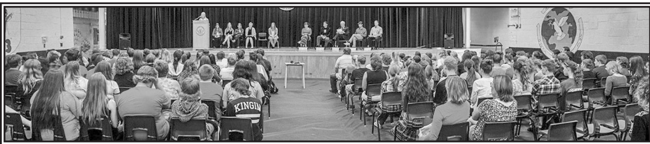
Over 150 students from Parrsboro Regional High School participated in an all Candidates meeting on September 18th.