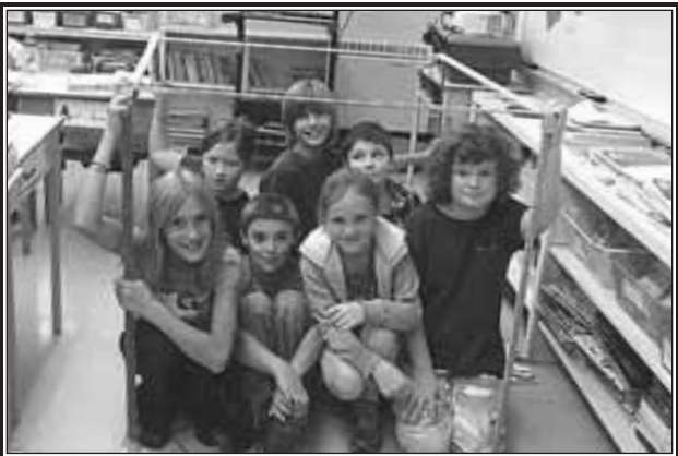
Grade 5 students from Bass River and Great Village built a million centimeter cube and tried to fit as many of themselves inside as they could.

While studying what one million would look like, students built a million centimeter cube and tried to fit as many of themselves inside as they could. Everybody is looking forward to a great school year.