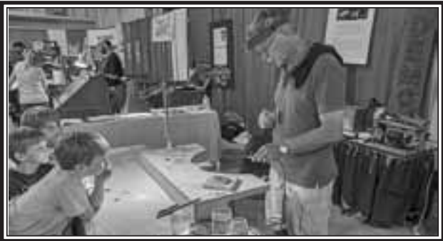
Demo booth 4 brought out the fascinated look as expressed on the faces of these young lads.