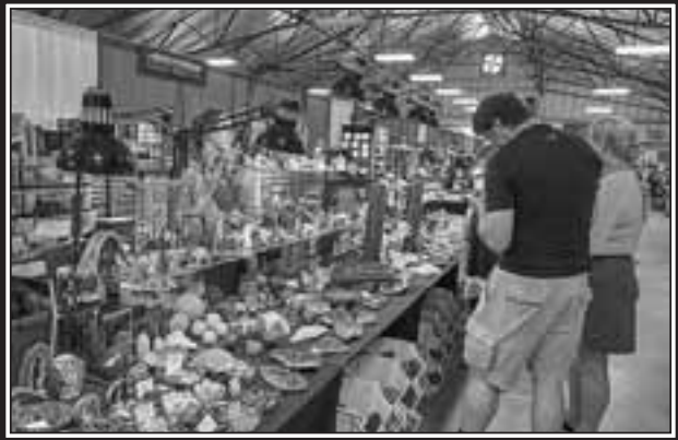
shows the magnitude of the 47th Annual Nova Scotia Gem & Mineral Show which filled the Lion's Rec Centre in Parrsboro on August 17, 18, & 19th. Exhibitors return each year from Ontario, Quebec, New Brunswick, Nova Scotia and Maine.