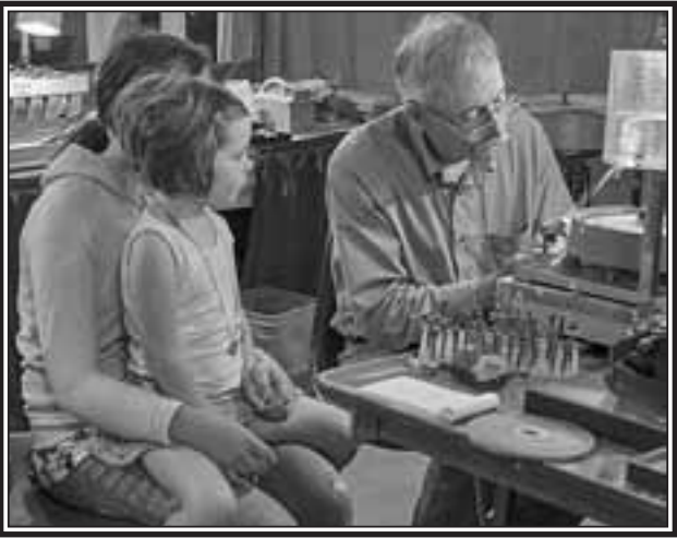
This young lady is paying strict attention to what is evolving in front of her.