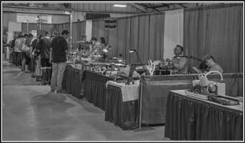
The Gem & Mineral Show in Parrsboro is no small event. Over 30 exhibitors set up similar to a major trade show in a large urban centre adorned the Lions' Rec Centre.