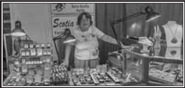
Scotia Gems, Yarmouth specializes in Nova Scotia agate.