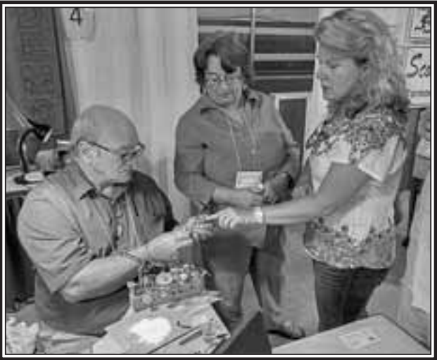
It's time for personal attention and a professional opinion. Exhibitors who return each year have become renowned for their professional advice.

In celebration of the area's Wild blueberry Festival Blueberry Cake was served daily.