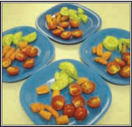
At lunch time students have been nibbling on and enjoying vegetables from the garden planted at the school last spring. In a couple of weeks, potatoes from the garden will be added to the school's Thanksgiving Feast.

Elizabeth Aikens is Principal Wentworth Consolidated Elementary