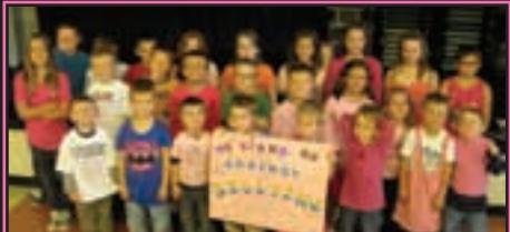
Wentworth Elementary Students also celebrated Stand Up to Bullying Day with an assembly. The older Multi-Age students read poems and essays, which they wrote, to the younger students describing their feelings on bullying. They students also signed a poster to promise that they would Stand Up against Bullying.

At Wentworth Elementary students signed a poster to promise that they would Stand Up against Bullying. The older Multi-Age students read poems and essays, which they wrote, to the younger students describing their feelings on bullying.