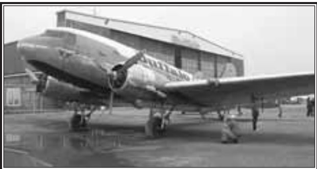
Paul gets up close for a photo of DC-3, one of the planes featured on the show "Ice Pilot's". (submitted)

Weather can be a more of an issue for smaller planes flying VFR (which means maintaining visual reference to the ground at all times) than for anyone flying by instruments (which the large planes do). Turbulence also affects lighter planes more than heavier planes.