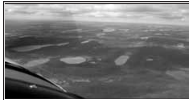
View of the tundra on a flight between Yellowknife and Hay River.