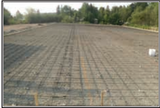
The Five Islands Rink was ready for cement by the first week of September with the new slab poured on Sept. 7th.

Looking ahead there is a ATV Rally on Sept. 29th. A Dance, with Andy Leblanc