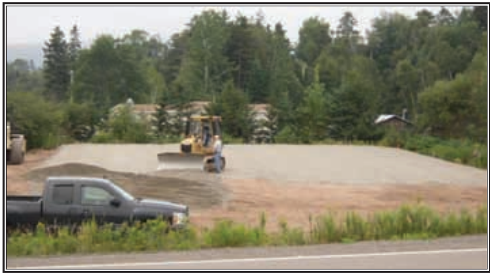
A good solid base was prepared before the cement slab was poured at the Five Islands Rink. Ball hockey is already being held on the newly renovated site. The Five Islands Athletic Association is holding several fund raisers to raise money for installation of the boards.