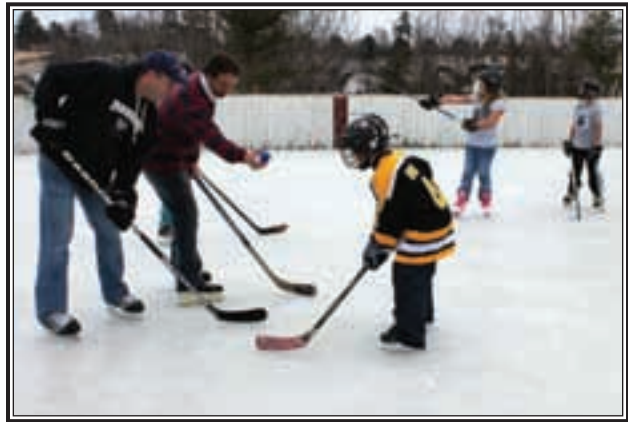
The Five Islands Rink was well used last winter. The mud floor has been replaced with a brand new cement slab, suitable for off season ball hockey along with ice hockey in winter months.

playing, is planned for Oct. 6th at the Five Islands Fire Hall.