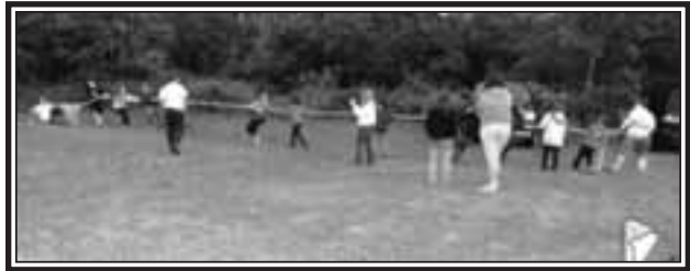
The Glooscap 4-H Club 10th Anniversary celebrations on July 14th ended with a tug-of-war.