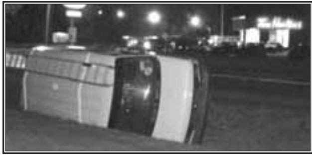
Fast food can be harmful to your health! The driver of a white utility van ended up in the ditch after trying to open a sandwich he had just purchased at Tim Horton's on Plains Road in Debert. No injuries were reported in the accident.