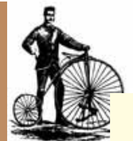
ANTIQUE FAIR Friday, November 12 1 p.m. - 8:00 p.m. $3.00