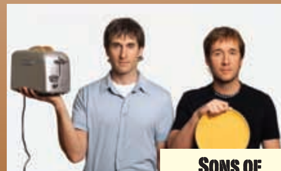
SONS OF MAXWELL CHRISTMAS SHOW Saturday, December 18 7:30 p.m. $20.00 Sponsored by Will Kare Paving