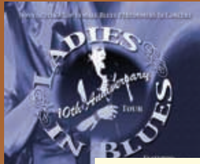
LADIES IN BLUE 10 th Anniversary Tour Thursday, September 30 7:30 p.m. $32.00 Diabetes Fundraiser