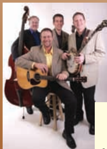
SPINNEY BROTHERS CHRISTMAS Sunday December 12 7:30 p.m. $25.00