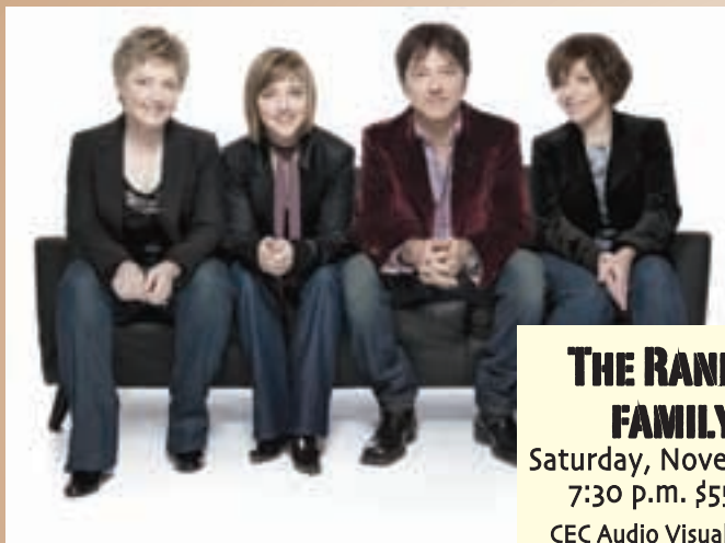
THE RANKIN FAMILY Saturday, November 6 7:30 p.m. $55.00 CEC Audio Visual Room