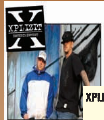
XPLIZIT ENTERTAINMENT Saturday, October 30 7:30 p.m. $15.00