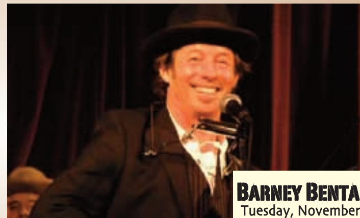
BARNEY BENTALL Tuesday, November 6 7:30 p.m. $25.00