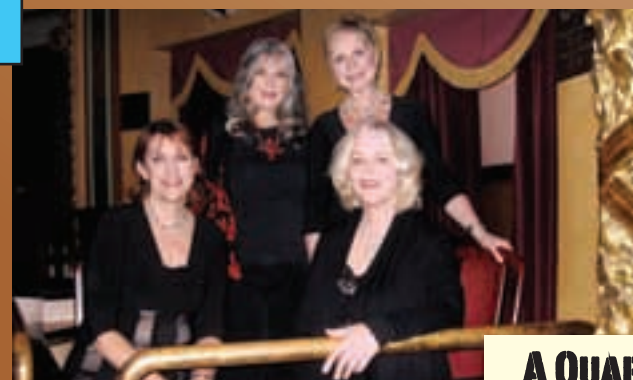
Presented by Debut Atlantic PENTAEDRE Thursday, November 16 7:30 p.m. $30.00