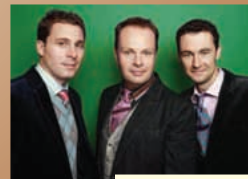
CELTIC TENORS Monday, November 29 7:30 p.m. $45.00