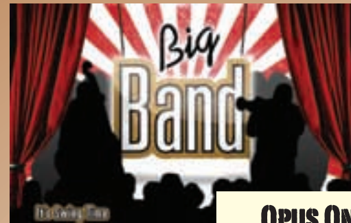
OPUS ONE Saturday, October 23 7:30 p.m. $25.00