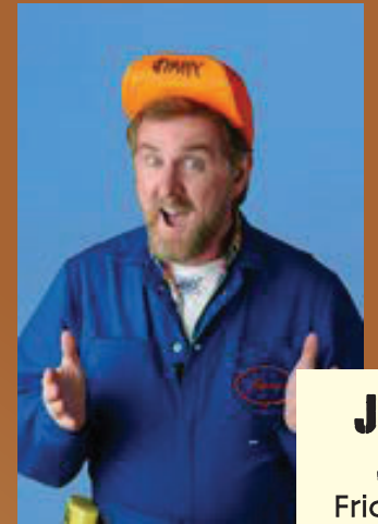
JIMMY THE JANITOR Friday, October 22 7:30 p.m. $29.00