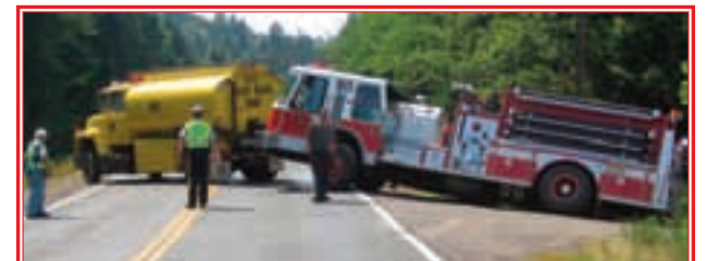
The pride of the driver was the only thing which was damaged, when the Five Islands fire truck backed into the ditch, when attempting to turn on Wednesday, August 31 st . A gentle pull from another vehicle from the brigade was all that was needed.