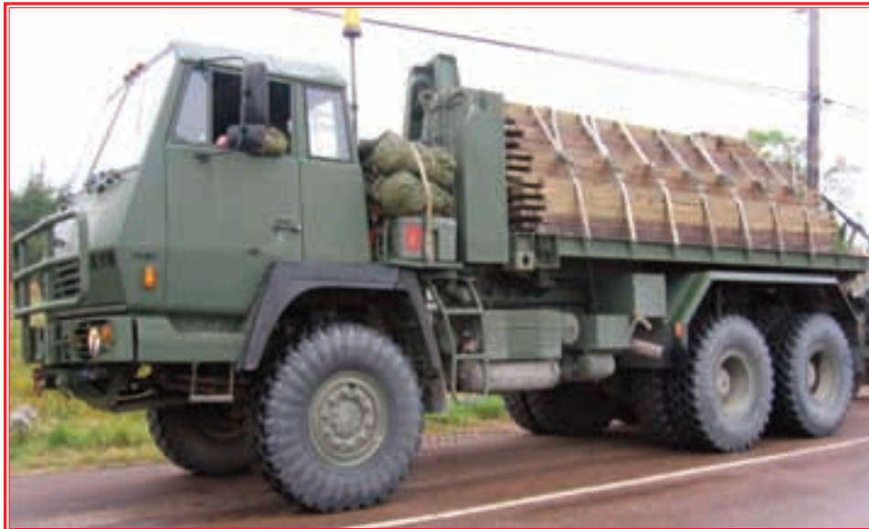
This large military vehicle was one of several which headed toward Newfoundland on Friday, September 24 th to help hurricane victims. Later in the day Prime Minister Harper ordered three Navy ships, Sea King helicopters; soldiers, vehicles and equipment from CFB Gagetown to help in clean up operations in Newfoundland. See more pictures on page 3.

For more information check out the Not Since Moses Run/Walk website at http://www.notsincemoses.com/