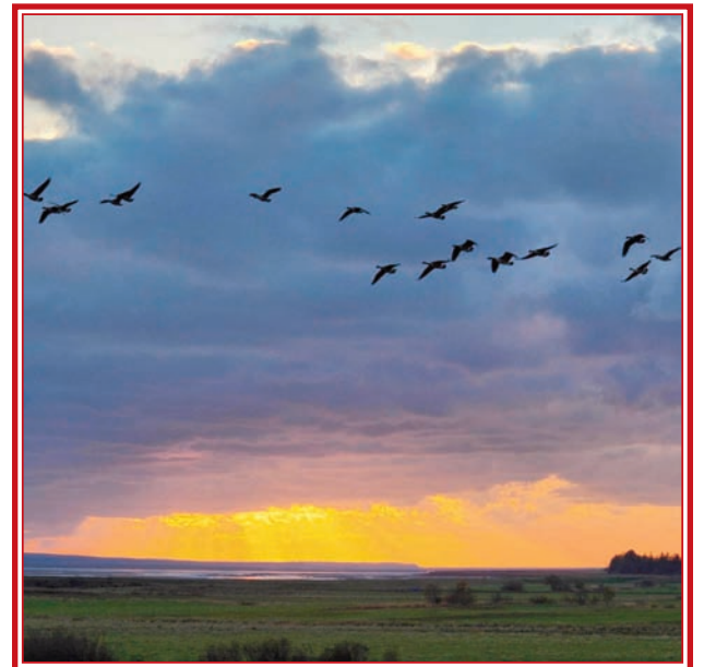
The beautiful pink sky was on my way to work at 7am and the photo above was the sunset on the way home about 6 pm. Just about any time of day is a great time to have a camera handy. The world has so many beautiful moments.