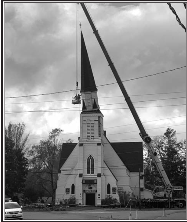
The steeple on Saint James United Church was damaged during the hurricane and within a few days it was removed and the roof sealed off. Angel's Diner on the Corner was back up an operational once power was restored.