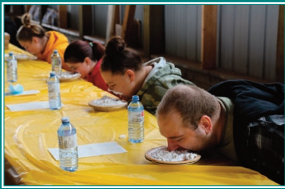
With a top prize of $200 up for grabs, the Pumpkin Pie Eating Competition was serious business.