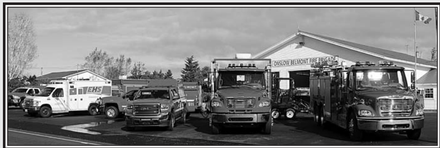
Onslow Belmont, EHS and Special Hazards emergency response vehicles on display at the OBFB Open House.