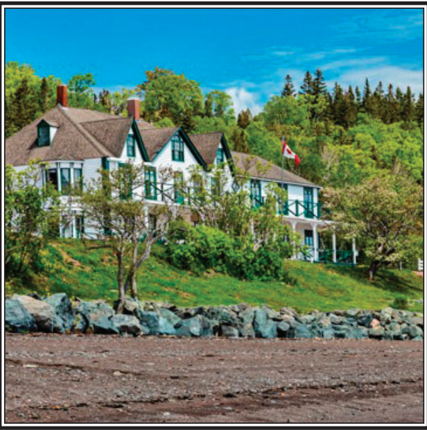
Ottawa House has become a "must visit" not only for its historical significant, but many people return for the sheer beauty of its setting on the Bay of Fundy.