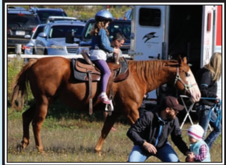
There were plenty of activities for the kiddies, including a straw bale climber and pony rides.