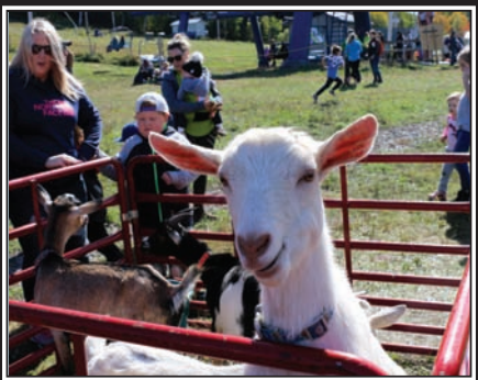
Hello there! Kids of all ages enjoyed the petting zoo.