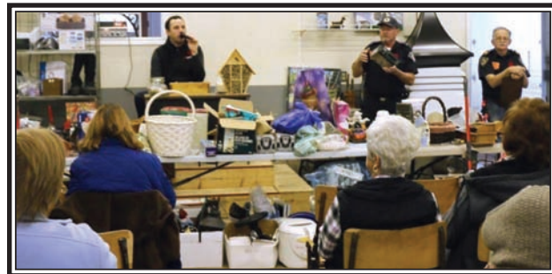
The Great Village & District Fire Brigade held their annual auction on October 27th.

The province was required to put a price on carbon under Ottawa's new rules. Under its plan Nova Scotia has set a goal of reducing emissions by 2030 equal to 45% to 50% of 2005 levels. In the October 23rd announcement the province said its system of capping the amount of carbon for large emitters requires them to either decrease emissions or purchase credits to meet the caps of carbon output. According to the province's data carbon will be reduced by 650,000 tonnes between 2019 and 2022.