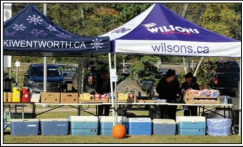
After all the fresh air and exercise the BBQ hot dogs and sausages were a popular choice.