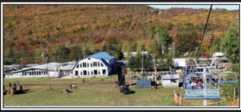
Beautiful day for a ride to the top, enjoying the gorgeous fall colours all around.

Fall Festival of Colours at Ski Wentworth- Beautiful weekend on Oct. 6 & 7th for scenic chairlift rides, guided hikes, pony rides, BBQ, jumpy castle and more!