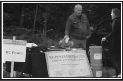
M-C Power Equipment, Lr Truro has a small display at the woodlot field day in Spencer's Island on September 30th.