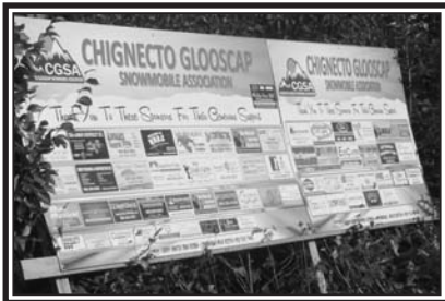
The Spicer family have worked closely with snowmobilers to respect woodland. As a result the Chignecto-Glooscap Snowmobile Association were present with an informative display and lots of signage.