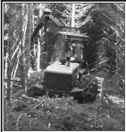
A live demonstration included this harvester.