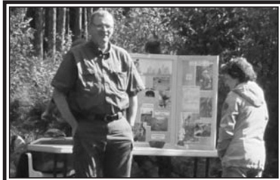
The Association for Sustainable Forestry display at the field day.