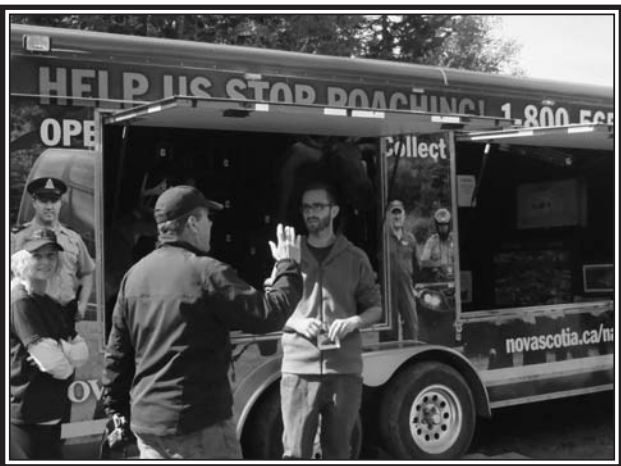
DNR's "Stop Poaching" display was prominent at the woodlot owner's field day.