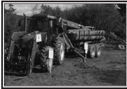
The Spicer family also put some of their own equipment on display.